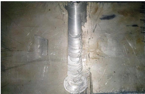
Figure 5: Welding joint of AA6063

After the conducting the experimentation of the friction stir welding of plates of AA6063 the two plates were joined successfully. This experimentation carried out with some results those are discussed in following sections. The welding joint is obtained as per shown in figure 5.