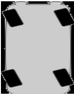
Fig.1. Crab turning radius mode

In the Crab turning radius mode, where in all wheels turn in same direction. This system is used at high speeds. This helps reduced centrifugal force on turns and prevents skidding of vehicle.