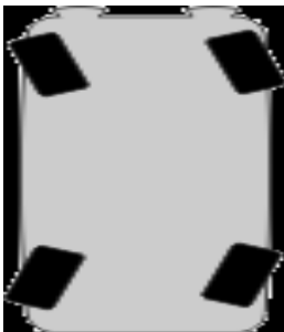
Fig 2. Reduced turning radius mode

b) Reduced turning radius mode : In the Reduced turning radius mode, where in pair of wheels turn in alter direction. This system is used at low speeds. This enables the vehicle to turn in minimal possible space.