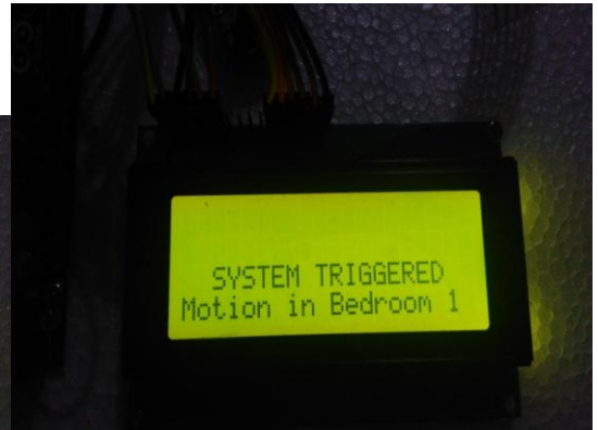
Figure: 4 MOTION IN BEDROOM 1

When movement is detected by sensor in bedroom and garage screen displays above window