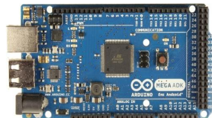
Figure: 1 Arduino Mega 2560

Arduino is open source electronics prototyping platform composed of a microcontroller, a programming language, and IDE. Arduino is tool for making interactive applications, designed to simplify task for beginners but still flexible enough for experts to develop complex projects.