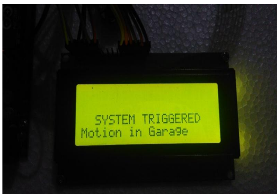
Figure: 3 MOTION IN GARAGE

After entering the pin system gets activated show the below screen i.e. details shown in figure 2.