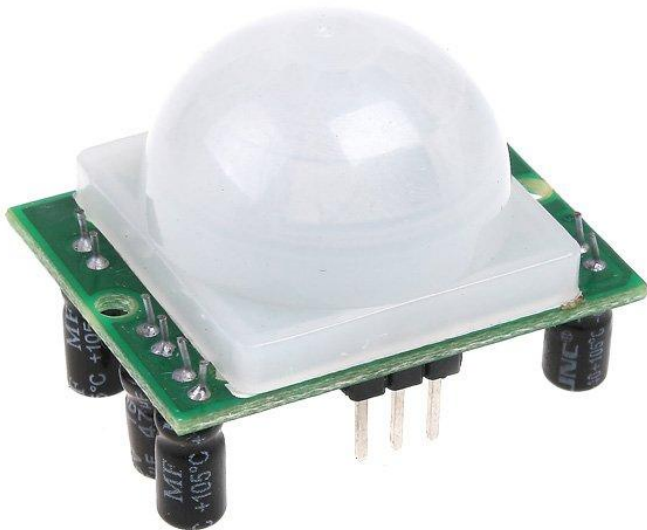
Figure: 2 PIR Motion Sensor

PIR sensors allow you to sense motion, almost always used to detect whether a human has moved in or out of the sensors range. They are small, inexpensive, low-power, easy to use and don't wear out. For that reason they are commonly found in appliances and gadgets used in homes or businesses. They are often referred to as PIR, "Passive Infrared", "Pyroelectric", or "IR motion" sensors. The PIR sensor is typically mounted on a printed circuit board containing the necessary electronics required to interpret the signals from the sensor itself. The complete assembly is usually contained within a housing, mounted in a location where the sensor can cover area to be monitored.