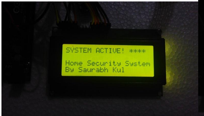
Figure: 2 SYSTEM ACTIVATION

After entering the pin system gets activated show the below screen i.e. details shown in figure 2.