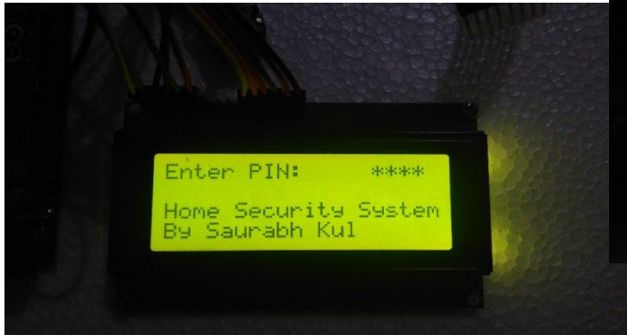
Figure: 1 SYSTEM ON WINDOW

When system is powered on, it shows above window