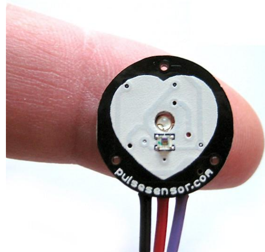
Fig3. Heartbeat sensor

A Heartbeat sensor is a monitoring device that allows one to measure his or her heart rate in real time or record the heart rate for later study. It provides a simple way to study the heart function. This sensor monitors the flow of blood through the finger and is designed to give digital output of the heartbeat when a finger is placed on it. When the sensor is working, the beat LED flashes in unison with each heartbeat. This digital output can be connected to the microcontroller directly to measure the Beats per Minute (BPM) rate. It works on the principle of light modulation by blood flow through finger at each pulse. The Pulse Sensor is a well-designed plug-and-play heart-rate sensor for Arduino. It also includes an open-source monitoring app that graphs your pulse in real time.