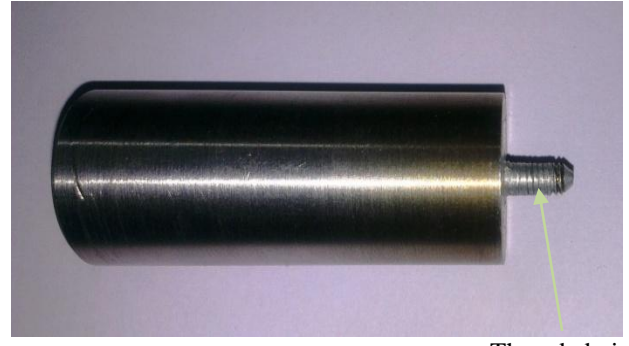
Figure 3: FSW Tool