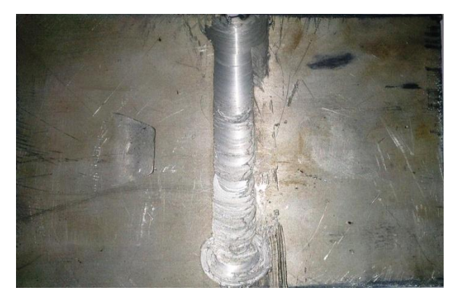
Figure 5: Welding joint of AA6063

After the conducting the experimentation of the friction stir welding of plates of AA6063 the two plates were joined successfully. This experimentation carried out with some results those ae discussed in following sections. The welding joint is obtained as per shown in figure 5.